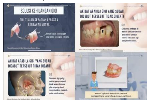
Figure 1 Snippets from the educational video

This study was conducted to obtain informa-