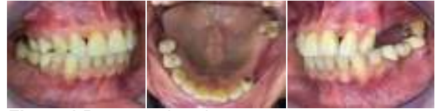
Figure 1 Pre-operative photos

plaint of multiple missing teeth in maxillary and mandibular arch, and inability to chew food properly and unaesthetic appearance. On intraoral examination, maxillary arch was completely edentulous and in mandibular arch 16, 17, 18, 24, 25, 26, 27 teeth were missing. All the teeth are still intact with good periodontal conditions (fig. 1).