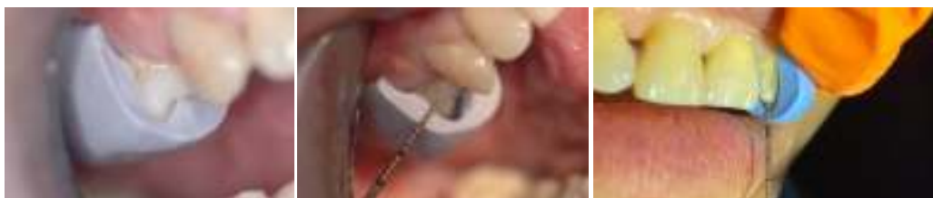
Figure 2 Measuring preparation using putty index)

Final impression was made with light body elastomeric impression material and poured in die stone. The provisories crown was fabricated using putty index and cemented using temporary acrylic (Charm-temp, Dentkist, Korea). Wax patterns were fabricated for all the prepared teeth, and a wax custom bar running over edentulous deficit ridge was connected to these prepared wax patterns. Ball attachment patterns (Rhein 83, USA) were attached to the custom bar (fig. 3). Selection criteria for precision attachment were based on location and length of the edentulous span.