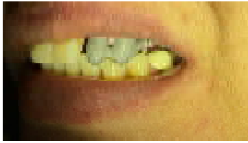
Figure 3 Try-in ball attachment (Rhein 83 USA)