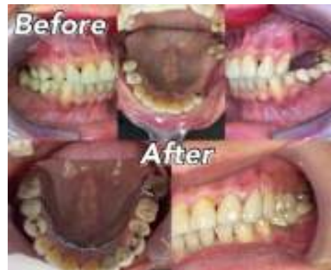
Figure 6 After insertion photos

and home care instructions were explained to the patient. Recall visits of 1- and 3-month follow-up of the prosthesis were found to be satisfactory in terms of function and esthetics (fig.6).