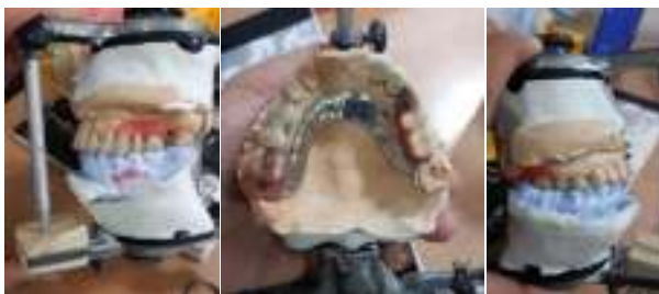
Figure 5 Jaw relation recorded on articulator

The wax occlusal rim was fabricated covering the edentulous area. The jaw relation was recorded followed by articulation (fig.5) and teeth arrangement was done to achieve unilateral balanced occlusion with disclusion of all nonworking side teeth on lateral excursion. Waxed denture try-in was performed followed by acrylization with heat-polymerized acrylic resin (Trevalon HI, Dentsply, India). Laboratory remounting, finishing and polishing of the prosthesis were done. Standard retention caps were inserted in the slot present on the intaglio surface of the RPD.